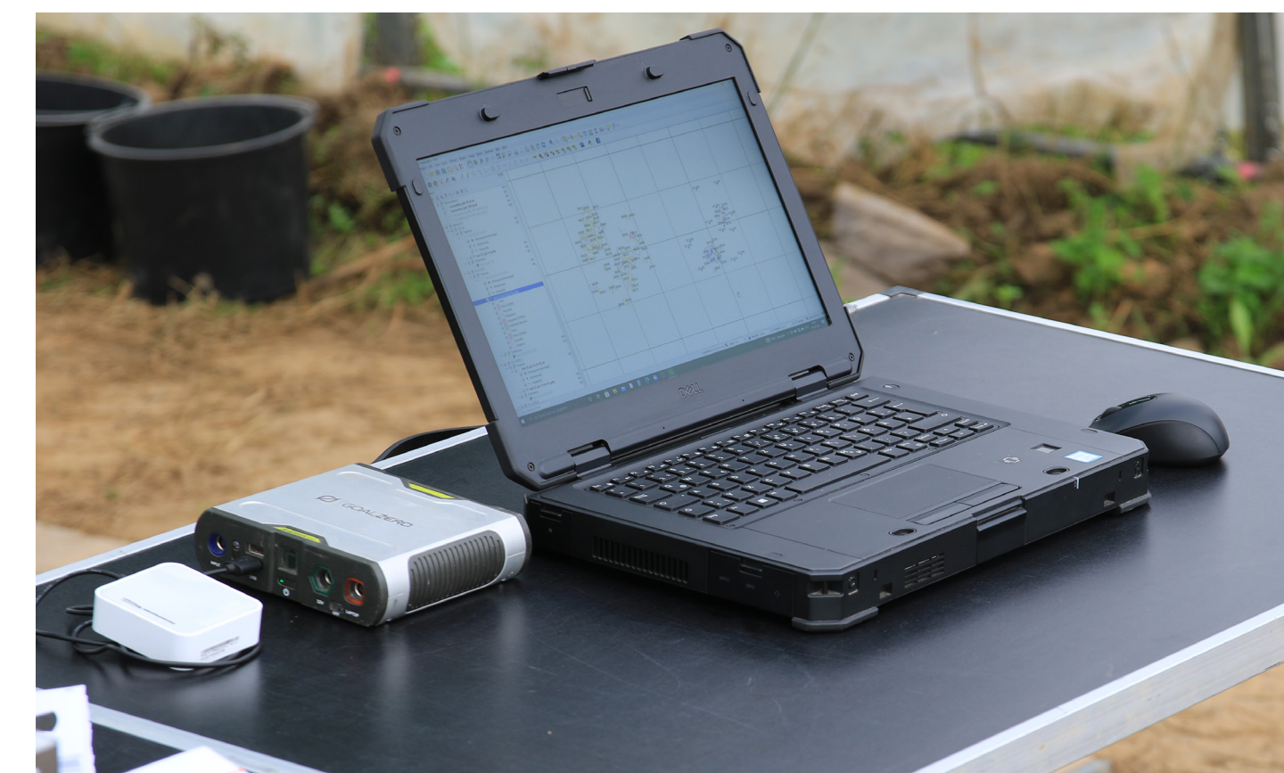
Step 1.4, Step 3 (cf. Fig. 1): An outdoor laptop is used as a central processing unit and data server.