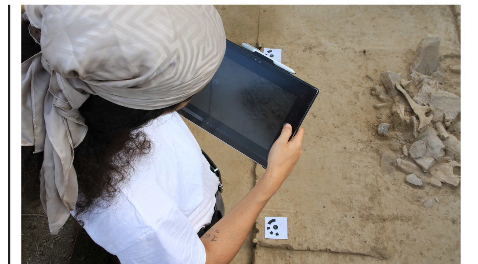
Step 2.0 (cf. Fig. 1): All objects are drawn in the digital environment using QGIS as the software for data handling.

One of the major bottlenecks in documentation in 2022 proved to be the SFM processing of orthophotos. For this, a python-script was devised. It allows for the full automatization of this step and will increase processing speed substantially.