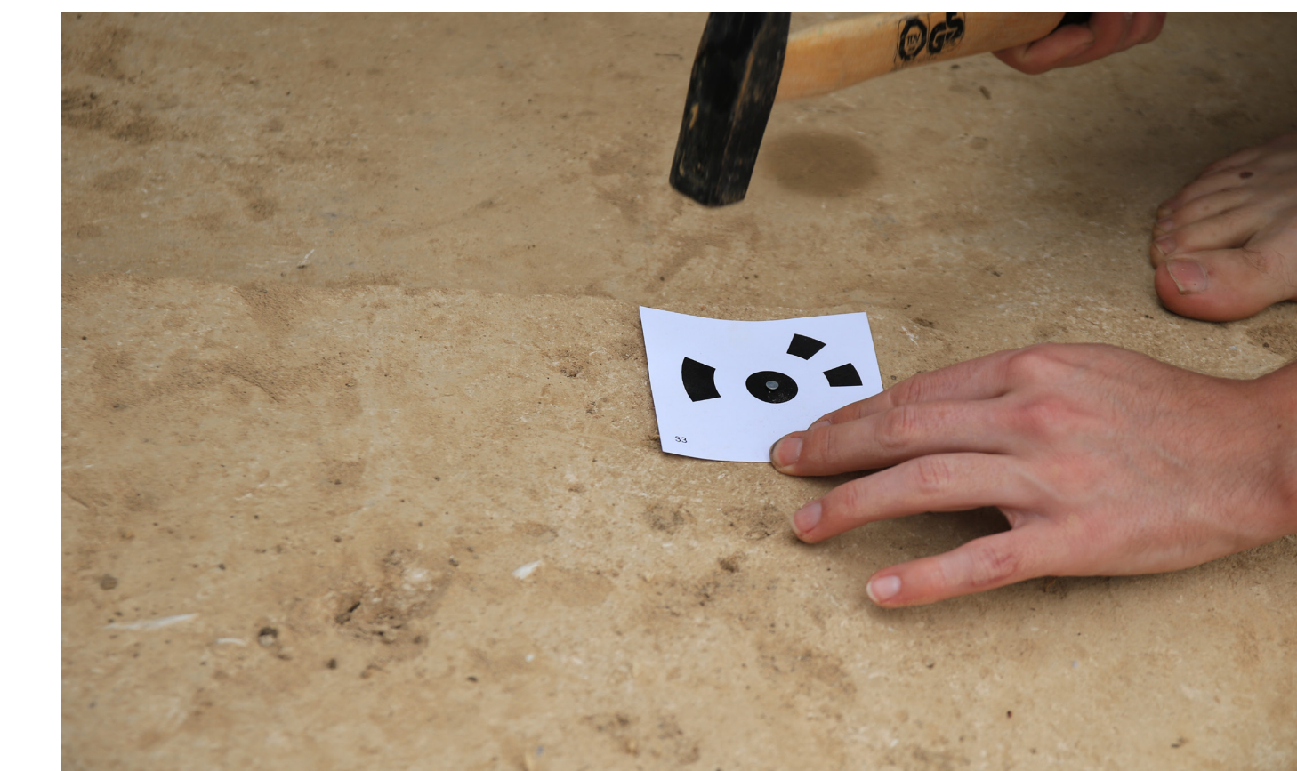
Step 1.1 (cf. Fig. 1): Markers are placed in the excavation area to allow for automated referencing of SFM models.