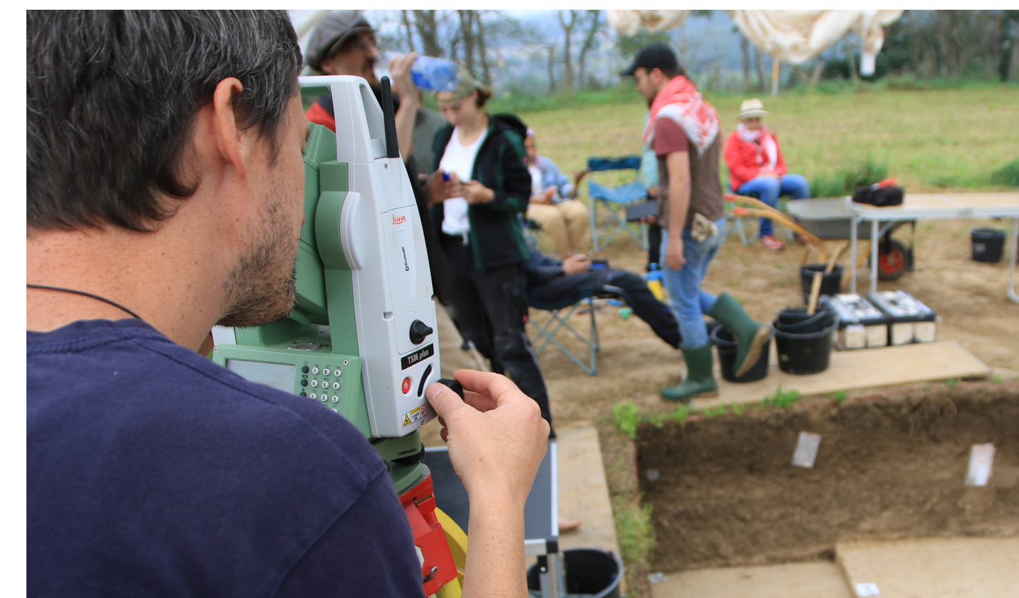
Step 1.2 (cf. Fig. 1): All marker positions are fixed by total station measurements.

For SFM-processing, all photos were taken with a DSLR-camera and processed on the central server laptop. This increased both the speed of processing and the quality of the final orthophoto.